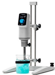
OV 625 Digital System